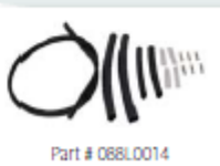
Part # 088L0014