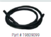
Part # 19809099