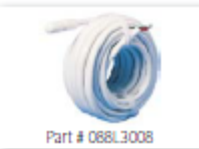
Part # 088L3008