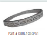
Part # 088L1050/51